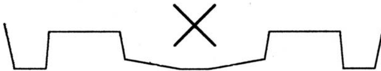
classed as a tunnel or multi-hull